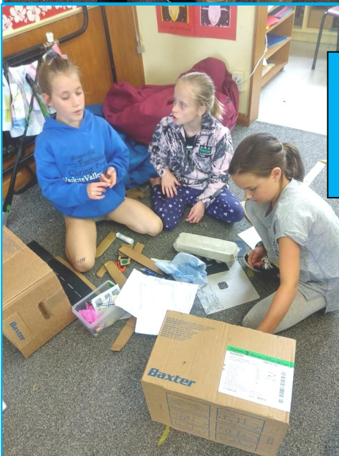
Room 4 working on their "Stop Motion" projects