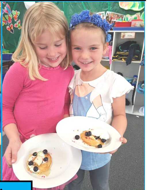
Room 1 read "If you give a pig a Pancake" then made and decorated their own Pancakes